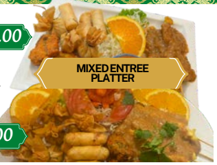
MIXED ENTREE PLATTER

MIXED ENTREE PLATTER $20.00 (min for 2 $10.00 PP) A combination of Spring Rolls, Money Bags, Curry Puffs, Samosa and Chicken Satay.